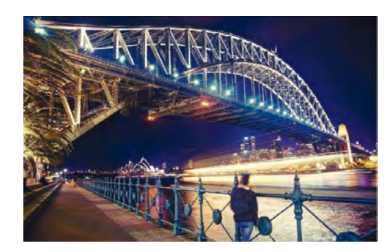
#iconicoz Instagram photo competition entry by Jessie, USA