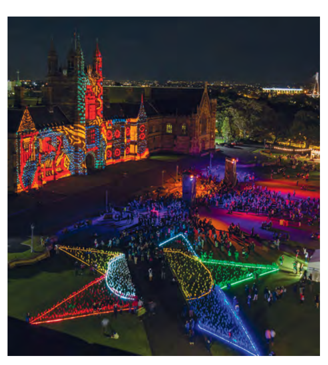
Vivid Lights at The University of Sydney