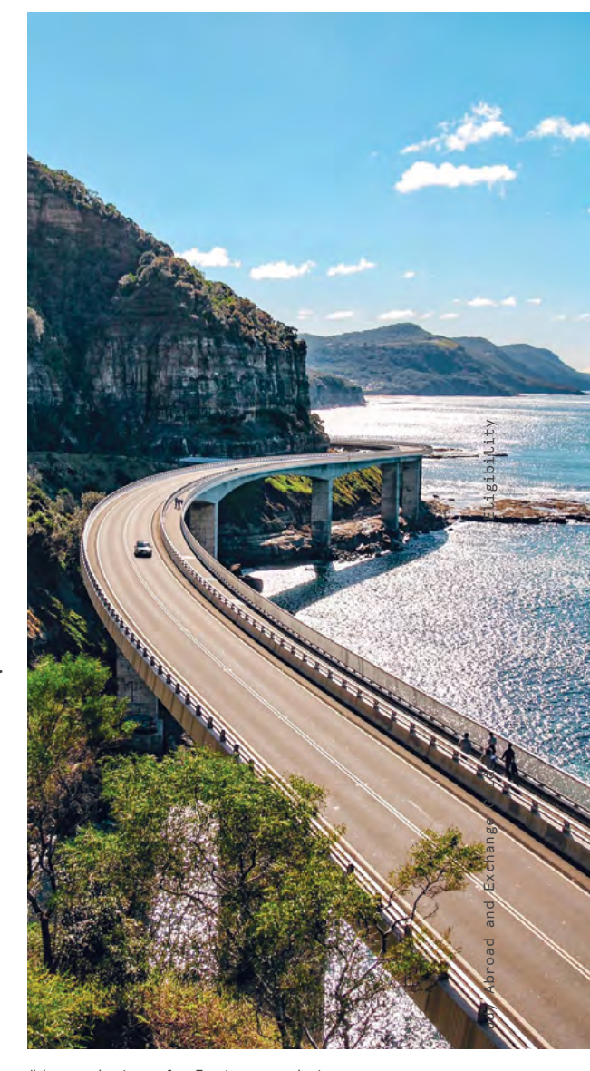
#downundertravels Instagram photo competition entry by Wyatt, USA

sydney.edu.au/study/under-18-international-student-visaholders.html