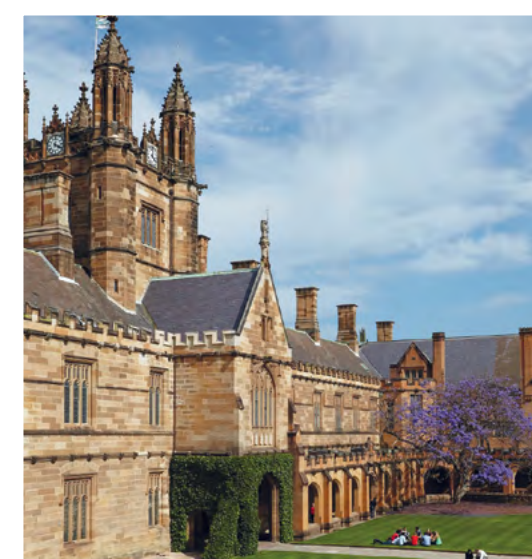
Below right: Queen Mary Building.

Additional materials, equipment and field trips may apply to some units of study. Amounts can range from $50-200 per unit of study.