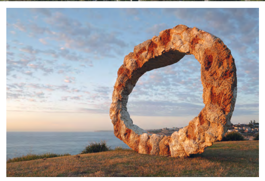
Every Spring, the Sculptures by the Sea event attracts thousands of visitors to the coastline exhibit on the walk from Bondi to Coogee.

Law student, University of Bergen, Norway