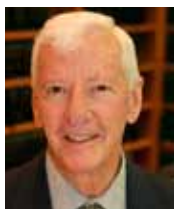
van der Vyver

A Square Peg in a Round Hole: Stretching Law of War Detention Too Far, 64 Rutgers Law Review (2011)